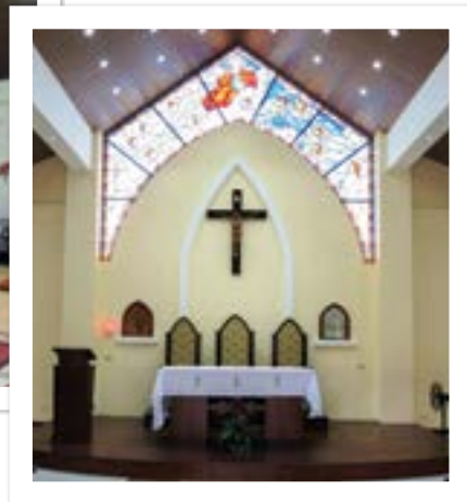
Newest chapel at Mt. Carmel Renewal Center, Tagaytay City, Philippines