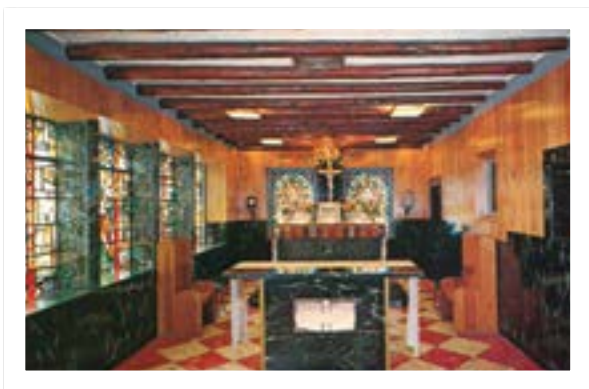
Original chapel of Servants of the Paraclete, Jemez Springs, NM