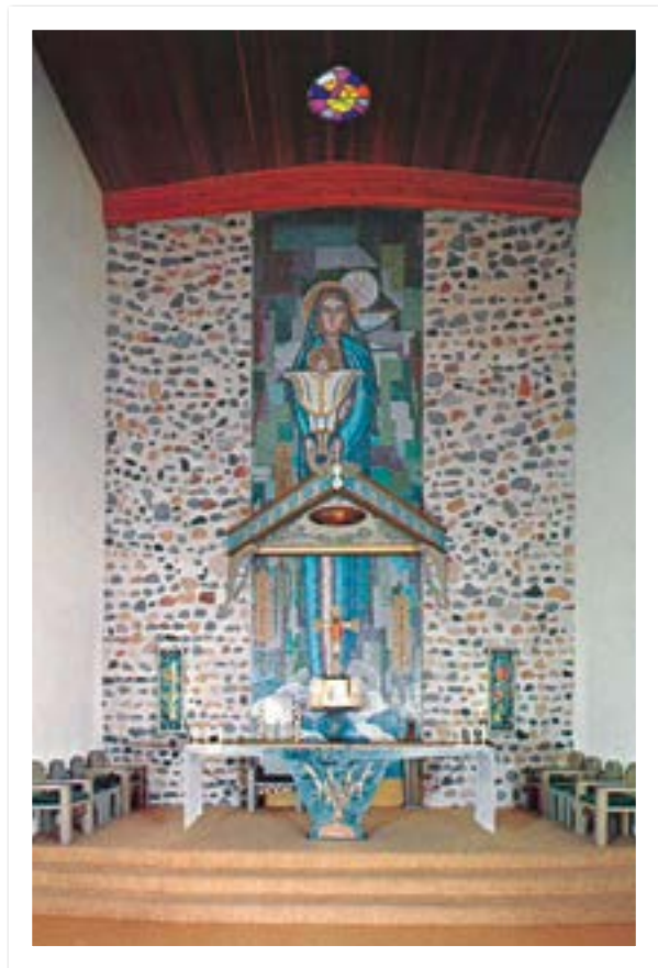
Mary Mother of Priest Chapel, Jemez Springs NM