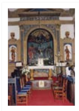
Chapel at Eremo in Siena Italy

O Sacrament most holy, O Sacrament divine! All praise and all thanksgiving be every moment Thine!