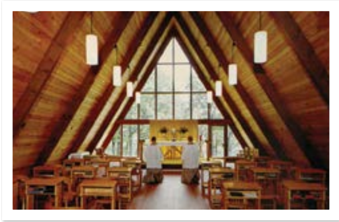
St. Michael's - former treatment center – Sunset Hills, MO

While the Servants of the Paraclete make use of much that nature and nurture has to offer, our deepest belief is that all healing for spirit and vocation comes ultimately from Christ, our Redeemer. The daily celebration of the Eucharist is the center of each day in our renewal and treatment programs. In this way the Eucharistic love of Christ shines on and brings life to all that is within our mind, heart and memory. The sunshine of nature and the radiation of fraternal charity are thus able to be transformed in a divine way.