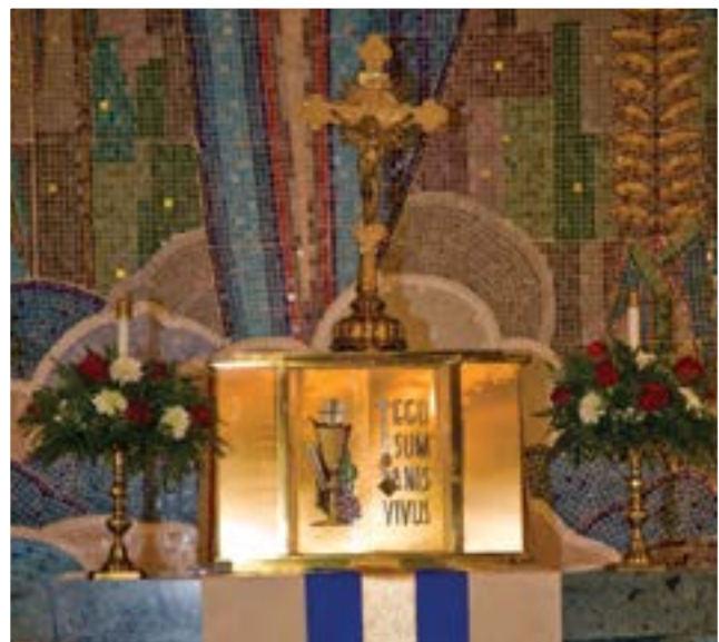
Tabernacle - Mary Mother of Priests Chapel