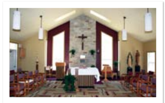
Vianney Renewal Center, Missouri