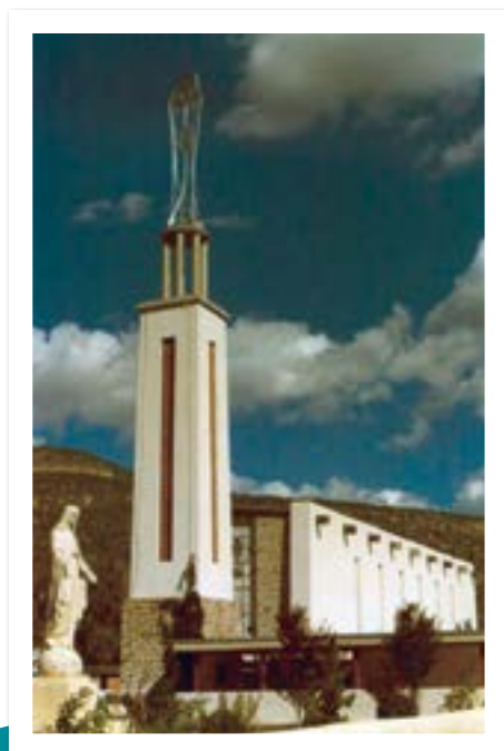
Old spire of Mary Mother of Priests Chapel