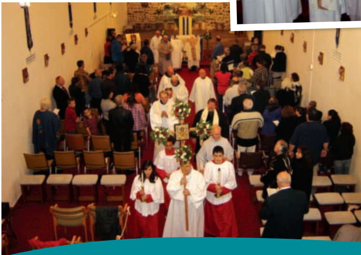
Recessional and closing of the 60th Anniversary Mass celebration